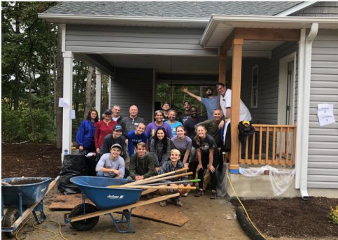
Group Picture at a Lincoln home Landscape event on October 20th.